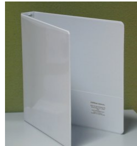
In-View Hardcover Binder

We are looking forward to a great school year!