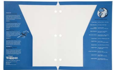
Picture of side pocket folder

**Please put your child's name on all supplies**