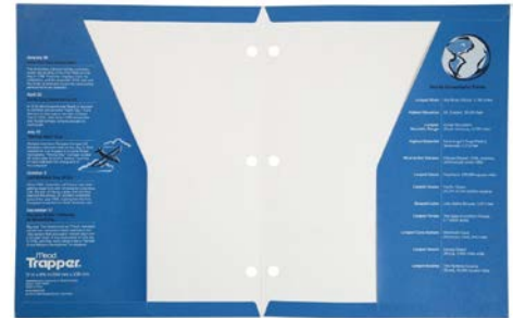
Picture of side pocket folder

**Please put your child's name on all supplies**