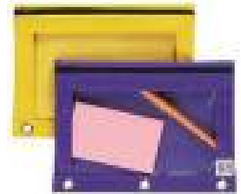
Binder Pencil Pouch