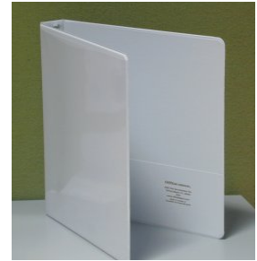
In-View Hardcover Binder